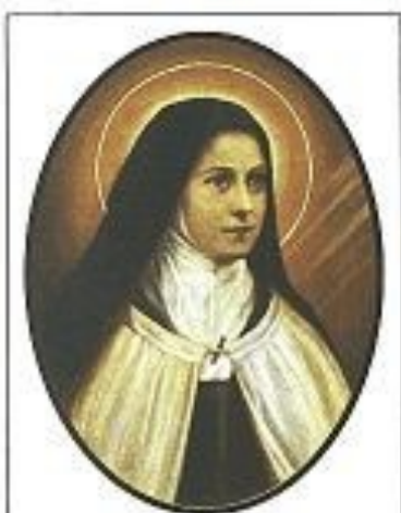
ST. THERESE OF THE CHILD JESUS

O Glorious St. Therese, whom Almighty God has raised up to aid and inspire the human family, I implore your Miraculous Intercession. You are so powerful in obtaining every need of body and spirit from the Heart of God. Holy Mother Church proclaims you "Prodigy of Miracles... the greatest saint of Modern Times." Now I fervently beseech you to answer my petition (mention here) and to carry out your promises of spending heaven doing good on earth... of letting fall from Heaven a Shower of Roses. Little Flower, give me your childlike faith, to see the Face of God in the people and experiences of my life, and to love God