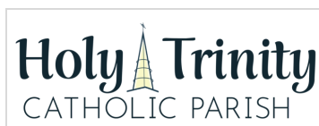
New Logo Direction- 01.png