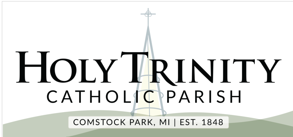
Holy Trinity Logo Sept Option-03.png