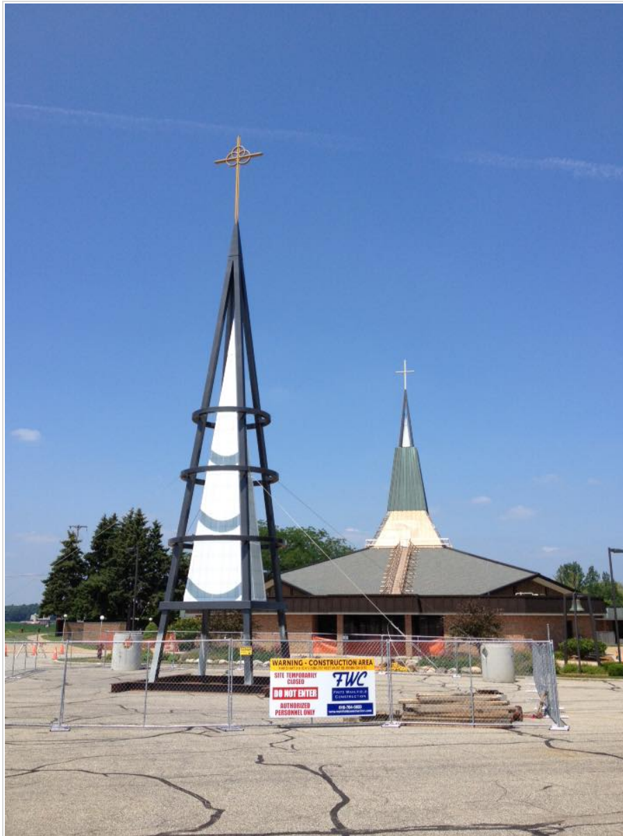
Holy Trinity Steeples old and new.jpg