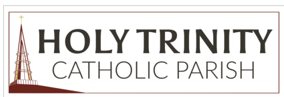
Holy Trinity- Comstock Park-05.png

The red square logo words are full width. However, I don't think the other logo's wording should be full width since it has that roof slant.