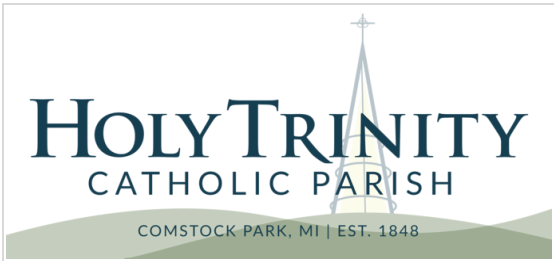
Holy Trinity Logo Sept Option-02.png