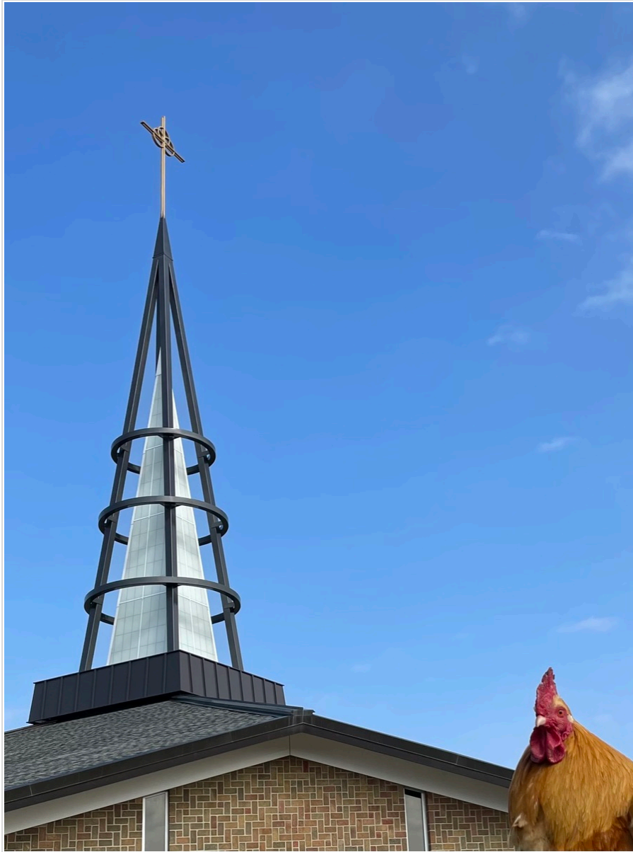
Steeple with Rooster .jpg