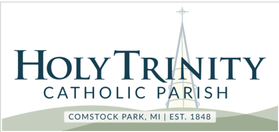
Holy Trinity Logo Sept Option-01.png