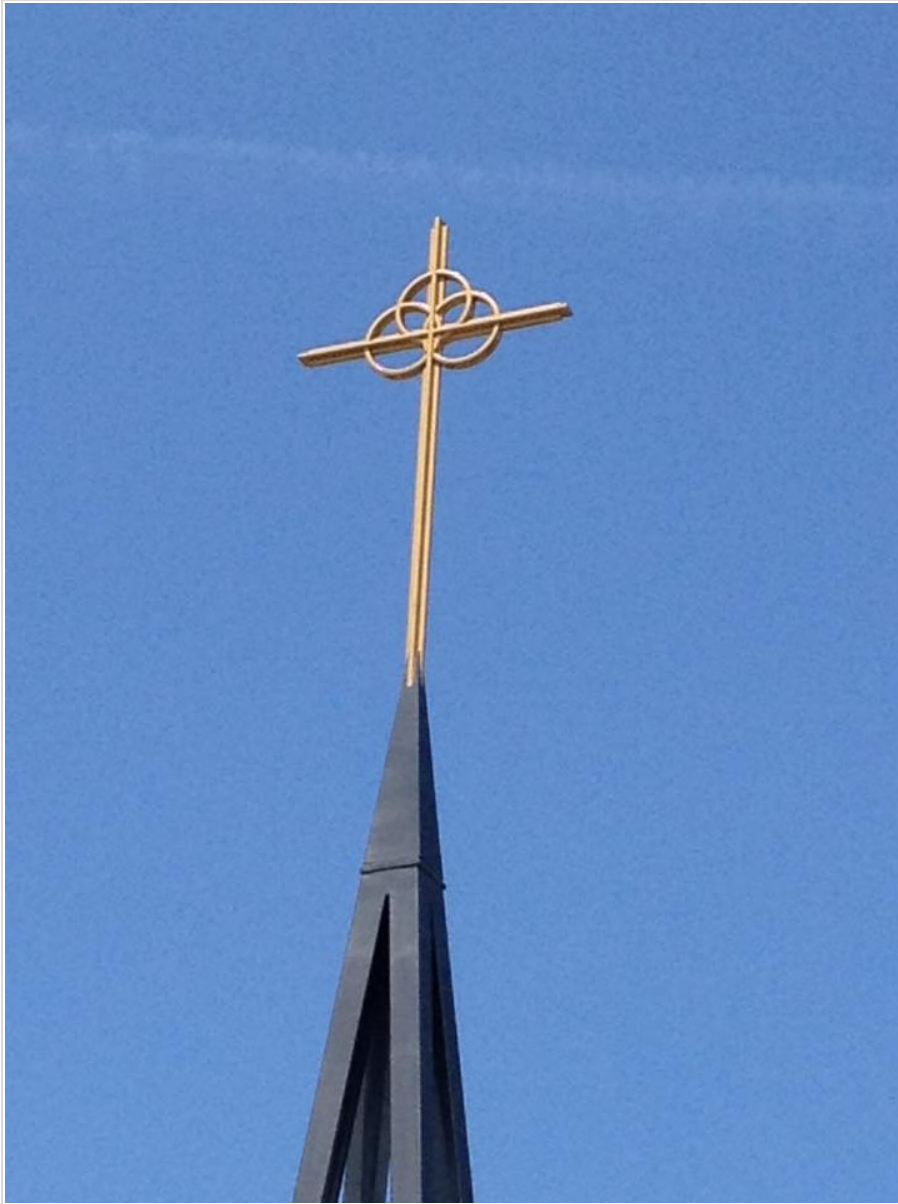
Holy Trinity Cross.jpg