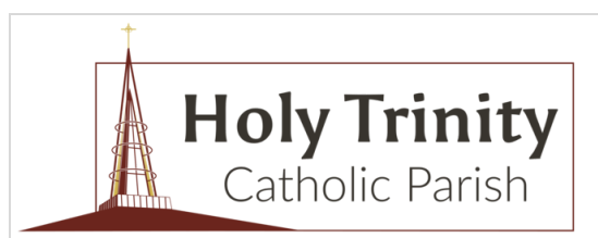
Holy Trinity- Comstock Park-02.png