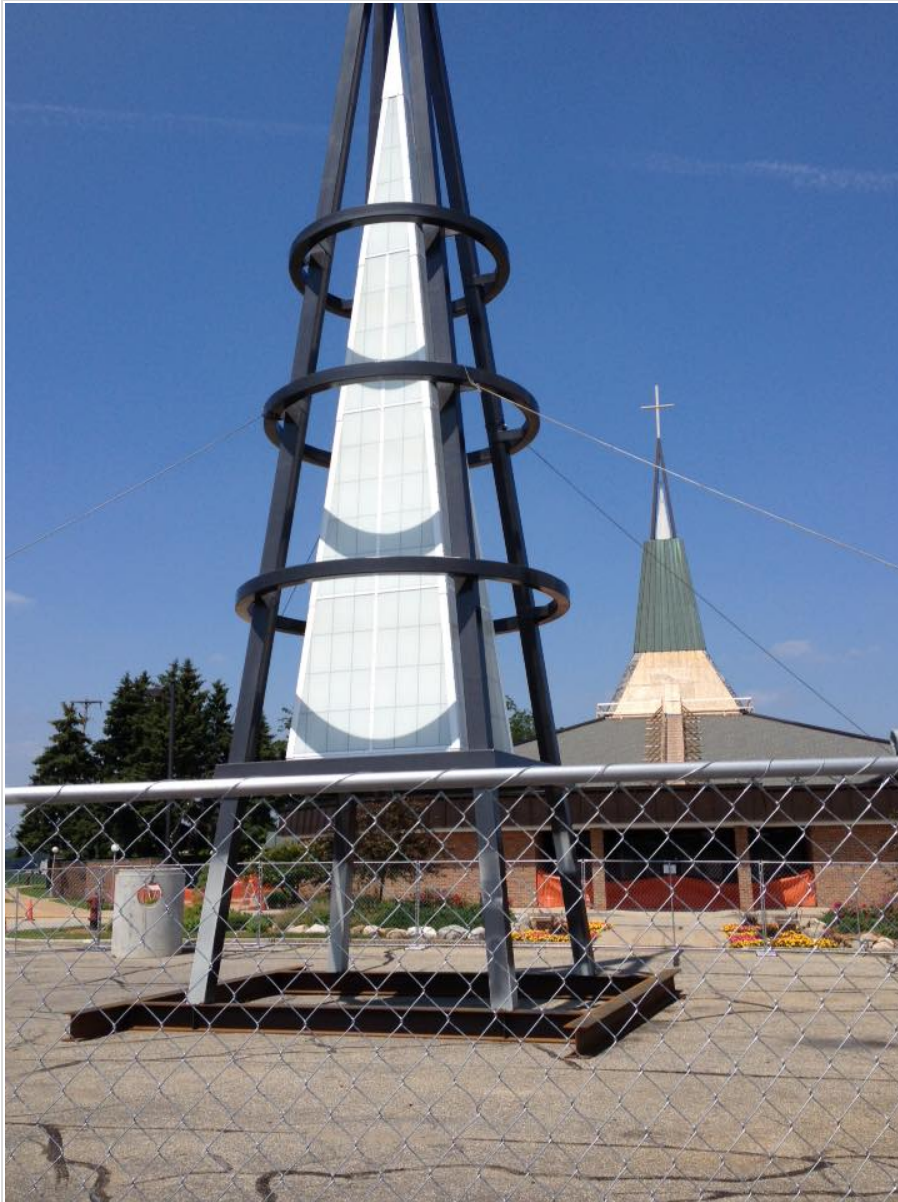
Holy Trinity Steeple Construction.jpg