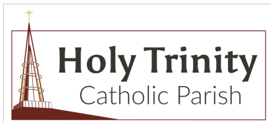
Holy Trinity- Comstock Park-03.png