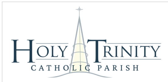
Sept 2 options-10.png

Here are the options we discussed today. Let me know what the staff thinks!