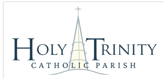
Sept 2 options-11.png

Thanks, Danae Chudy Diocesan Publications Web Designer 877-923-0777