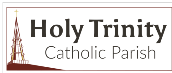
Holy Trinity- Comstock Park-04.png